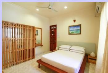
3 DELUXE ROOMS