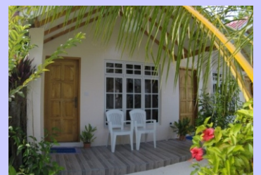
4 KING ROOMS