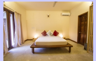
4 QUEEN ROOMS