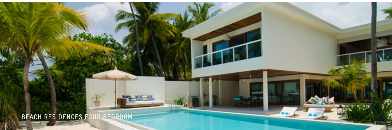
BEACH RESIDENCES FOUR BEDROOM