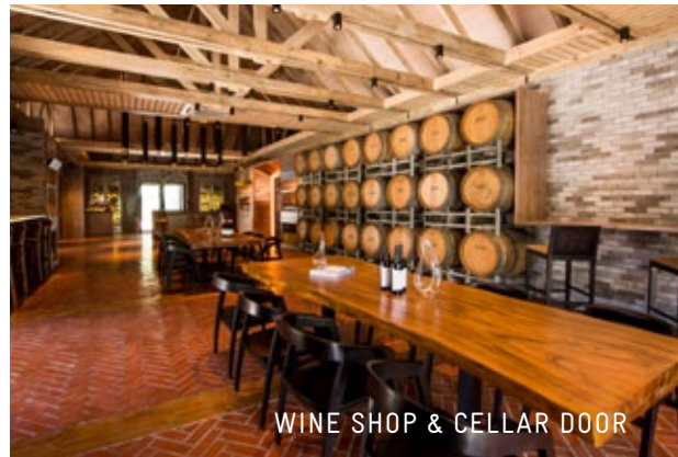
WINE SHOP & CELLAR DOOR

The Wine Shop houses a wine cellar with 10,000 bottles of wines. Guests can either choose a case of wine or a single bottle of their choice. Operating as a cellar door, guests can also partake in curated wine tastings accompanied with a selection of artisanal cheeses.