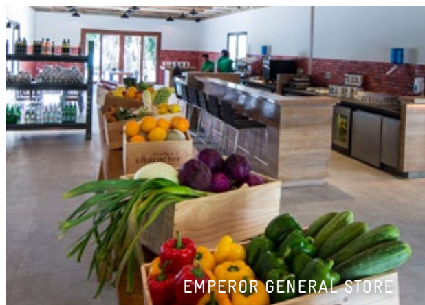
EMPEROR GENERAL STORE

An old fashioned, artisanal, gourmet café and deli. Promising to deliver to the most high end needs of the foodie in you, the General Store is a marketplace of fresh fruits, vegetables, bakery items, meats and deli produce that you or your Katheeb (Butler) can cook in your Island home.