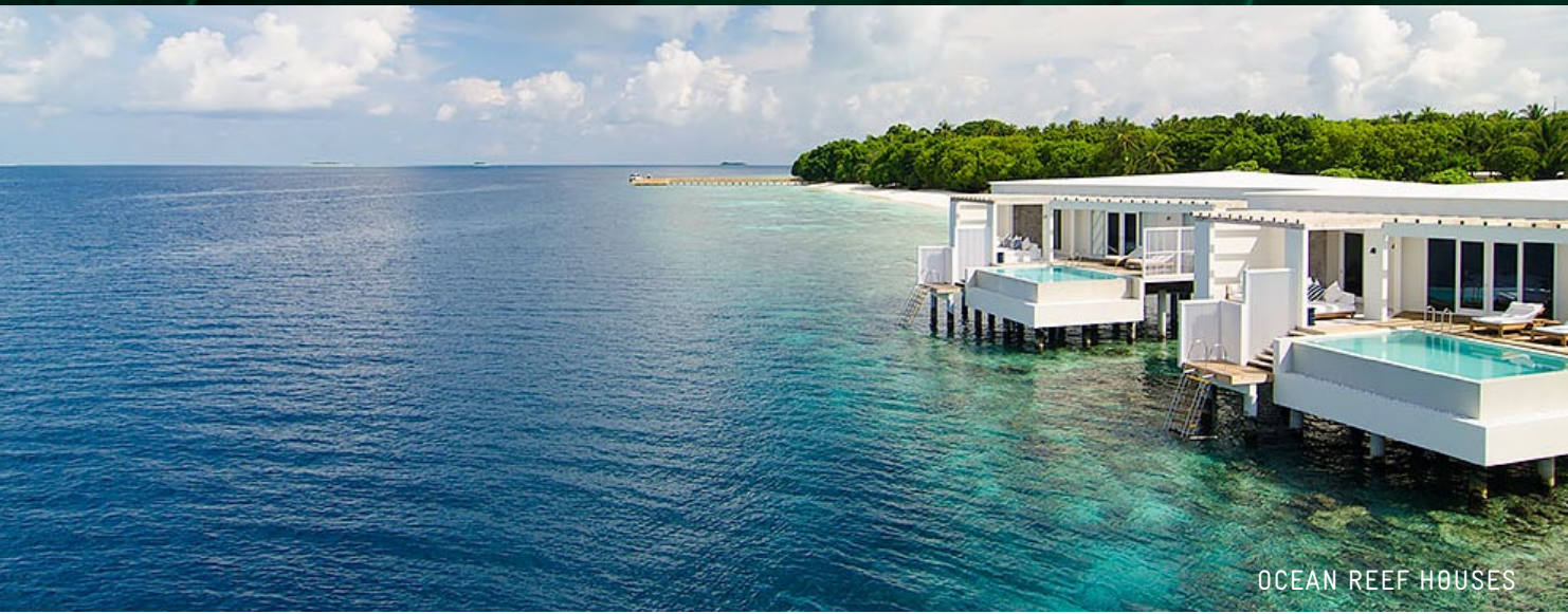
OCEAN REEF HOUSES