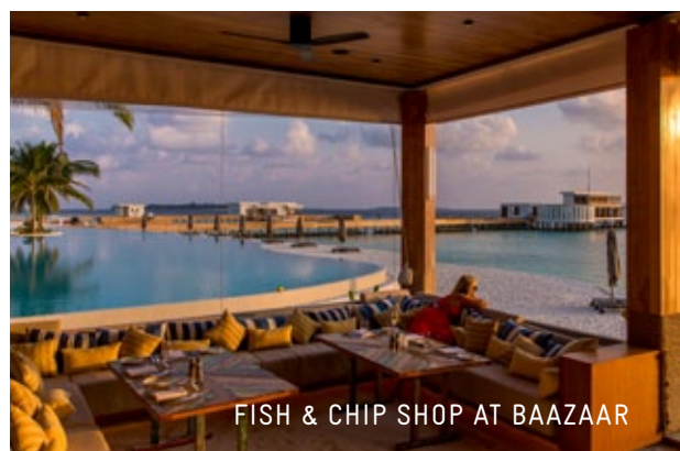
FISH & CHIP SHOP AT BAAZAAR

Centered around our pool is the hub of the Island, a food 'baazaar' of diverse culinary offerings from around the world where you will find something to suit your palate at either Fresh, Wok, Grill, Baazaar Bar, Joe's Pizza and even the first proper Fish & Chip shop in the Maldives. Guests come here to mingle or sip a cocktail at the bar whilst taking in the spectacular sunsets.