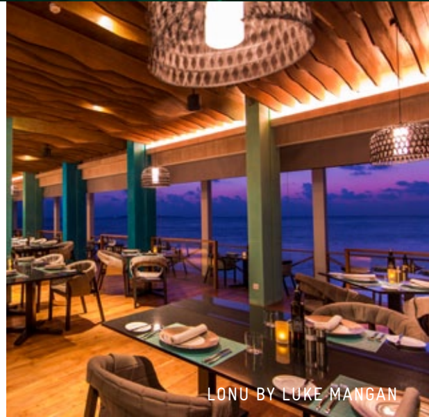
LONU BY LUKE MANGAN

Internationally renowned chef and restaurateur Luke Mangan is heading the restaurants for Amilla Fushi. Lonu offers relaxed, sophisticated, over water dining with breathtaking ocean views coupled with a stunning rooftop Sunset Bar for pre or post dinner cocktails. Our menu is the product of Luke Mangan's lifelong mission to source the best of the best, including the highest quality local produce and exotic ingredients from the East and West, perfectly paired with exquisite wines and beverages from around the world.