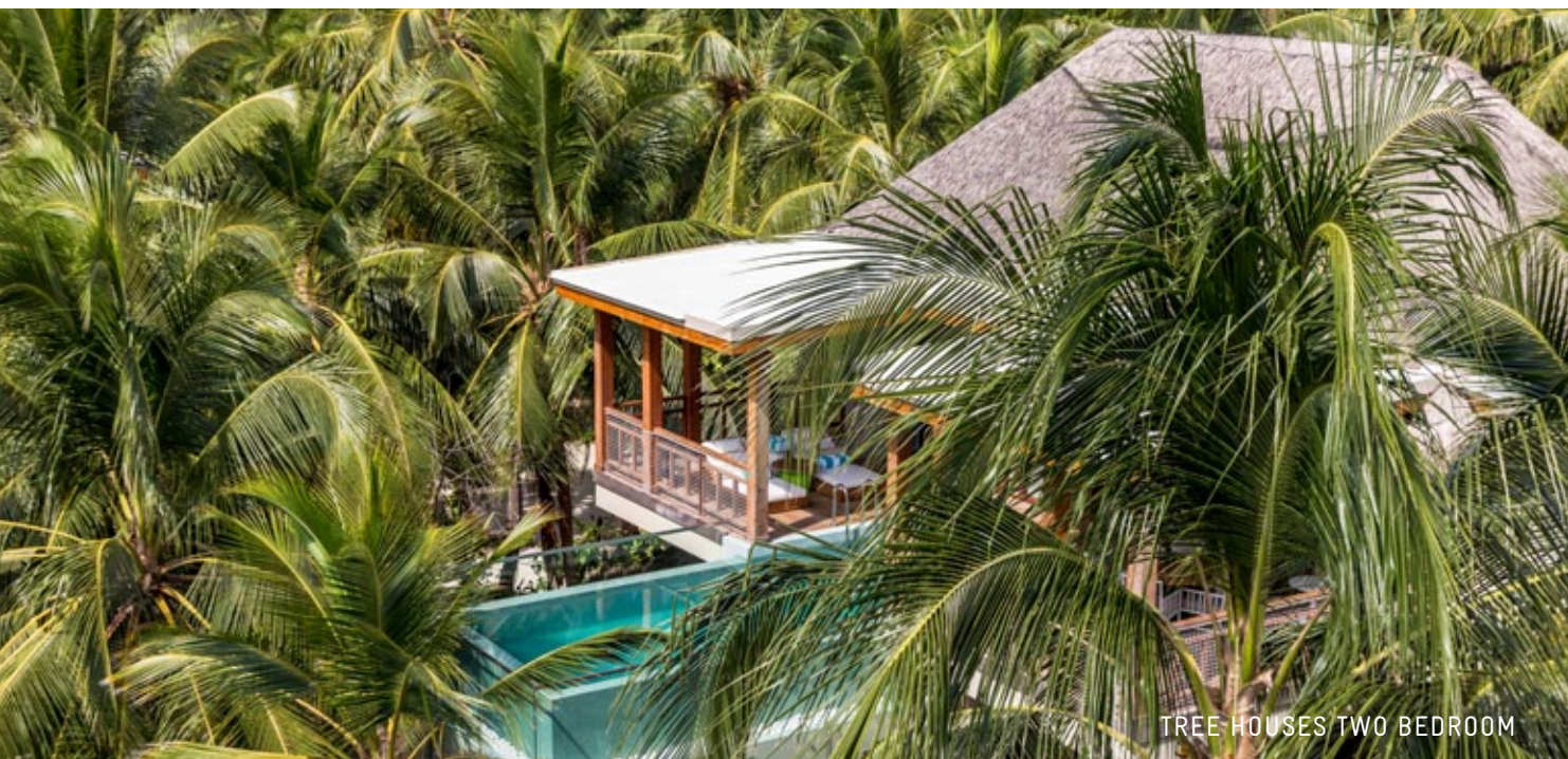
TREE HOUSES TWO BEDROOM